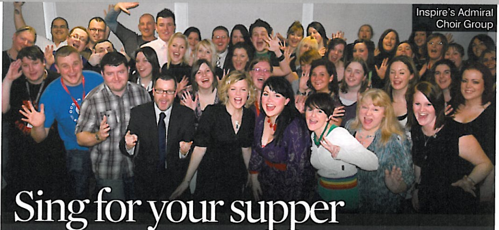
Inspire's Admiral Choir Group